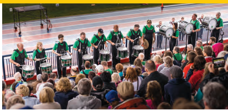
The performance was up close and personal due to the rain.