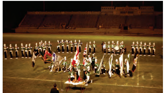
1965 Toronto Optimists.

Let's hear from you. If you choose to share your contact info, we will happily add it to our alumni records and include you in future mailings.