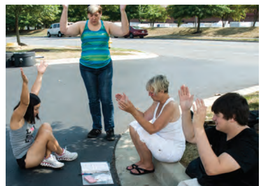
"I sure hope no one takes a picture of us doing this." An actual living music stand.