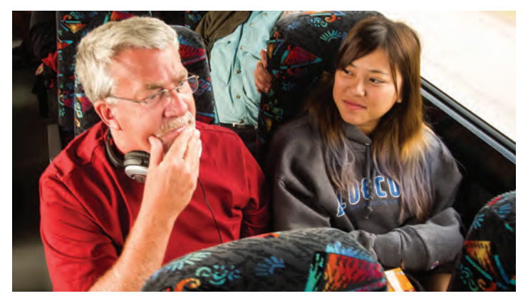
"Are you sure this isn't the Blue Saints bus?

Both "Back in the Day" and today our Bus trips have been a time for us to connect as friends rather than as corps members. Here are a few photos from our trips to Sudbury and Annapolis.