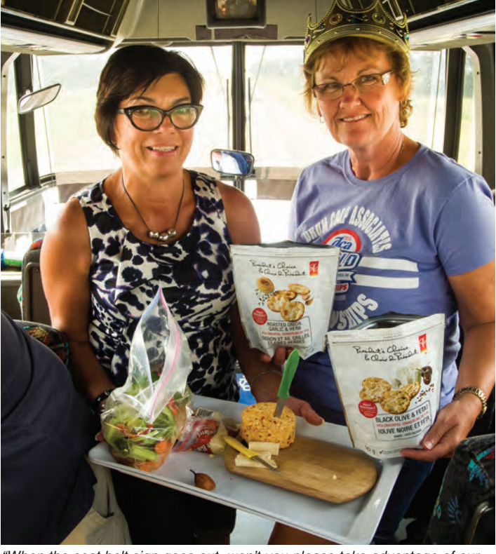
"When the seat belt sign goes out, won't you please take advantage of our on-board snack service, and thank you for providing your own beverages".