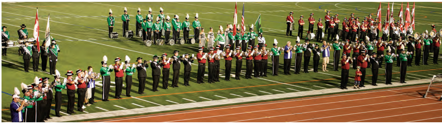
Closing ceremony. Massed horns playing "You'll Never Walk Alone".