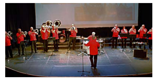
Sudbury Imperial Knights Alumni Band.

The show ended with a performance of Autumn Leaves, played by members of all the participating corps. After the show we relaxed with a dinner and dance. A wonderful celebration to end the season! Thank you Midlanders.