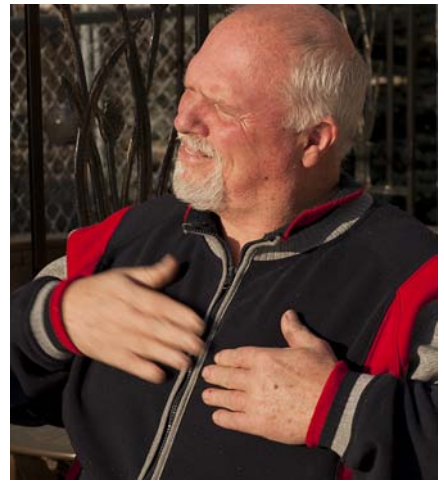
"Not so loud, try this... zum zum de zum de."