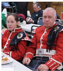
Members of a local pipe band prepare for the parade.