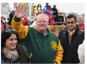
Newly-elected Mayor, Rob Ford, led the parade.