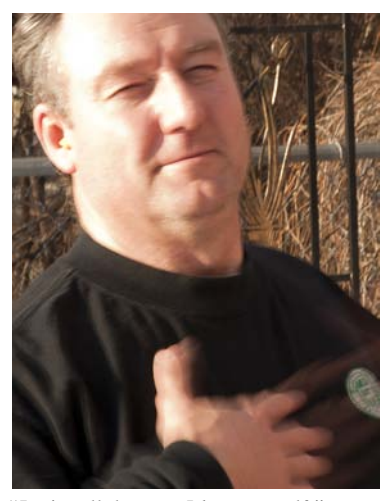
"Let's talk later... I hurt myself."