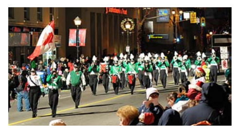
Optimists Alumni on parade.