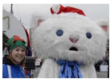
A really big, walking snowman cat.