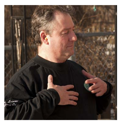
"It sounds better on black, zum de zum dikity dum!"