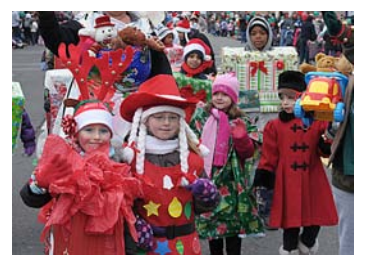
Kids were everywhere.