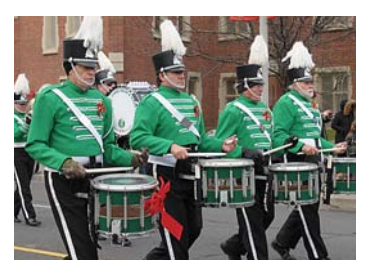
Always a crowd-pleaser.