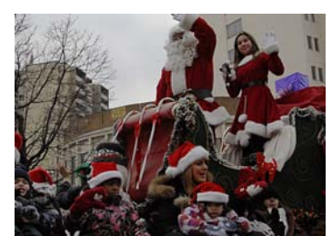
Santa and more kids. Just the way a parade should be.