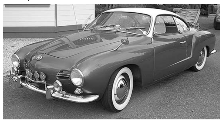
My 1959 Carman Ghia

I decided to buy something a little more economical. I saw this red Carman Ghia in a showroom window and said this is for me. Sporty and cheap to run. What I didn't know was that no-one could see me. I had two big accidents in this car and that was enough. That name of "CRASH" carried on, as well as many more cars.