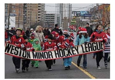
Community organizations were the focus of this parade.