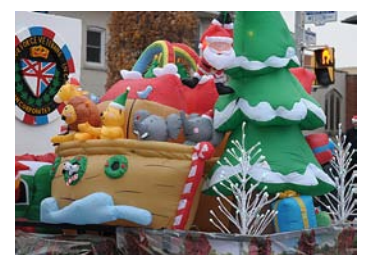
One of the many colourful floats.