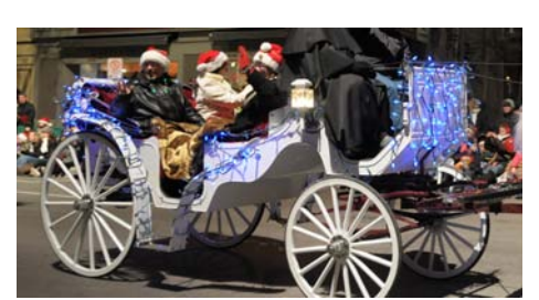
Parade dignitaries ride in style.