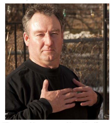
"Zum zum dikity zum zum dikity, dikity!"