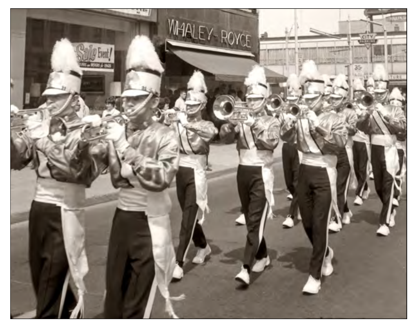
Toronto Optimists on Yonge Street in front of Whaley-Royce (1965)

Over the years Whaley-Royce had occupied, at different times, a number of locations on downtown Yonge St. They moved their wholesale division to suburban Scarborough in 1975. At that time, the company ceased manufacturing instruments. It gave up its downtown location in 1976. While Whaley-Royce might have disappeared into history many members of Toronto's drum corps