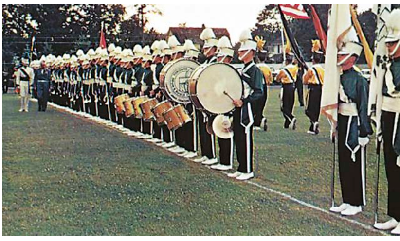
1961 - Toronto Optimists being inspected, Phillipsburg, New Jersey.

of the previous two or three years). It had rained heavily and the grass was very slippery. During our performance one of our corps members had slipped on the muddy grass with their knee touching the ground. They stood upright and finished the show. A judge wrote that he almost missed it because the recovery was so smooth; however, he still penalized us a tenth