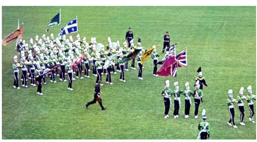
Toronto Optimists 1963 "El Cid" triangle which often captured drum judges.