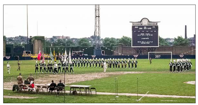
Toronto Optimists competing at Roosevelt Stadium in the 1960 "Preview of Champions". You can see that the only markings are an outline of the competition field.

Corps contests were held on an American size football field (100 yards long x160 feet wide vs 110 x 65 yards for a Canadian field). In the old days, the only lines on the field would usually be the sidelines and, perhaps, a line indicating centre field. Some of these fields were closer to cow pastures