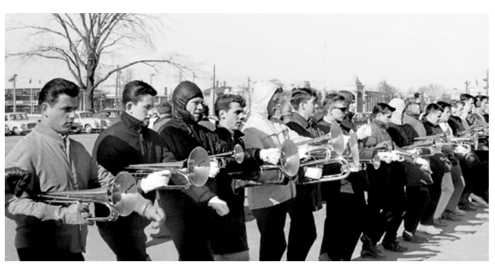
Toronto Optimists practicing on Easter Weekend, 1963, in the parking lot of the Shell Tower at the CNE (Canadian National Exhibition) grounds. The temperature was a chilly 5°C, which is 39°F.

armouries which meant that they could develop their drill during the winter. As a result, they were able to finish learning the drill for their shows early and their competition season usually began in early May. Their season would end after the VFW and AL championships which were usually held in mid-August and early September.