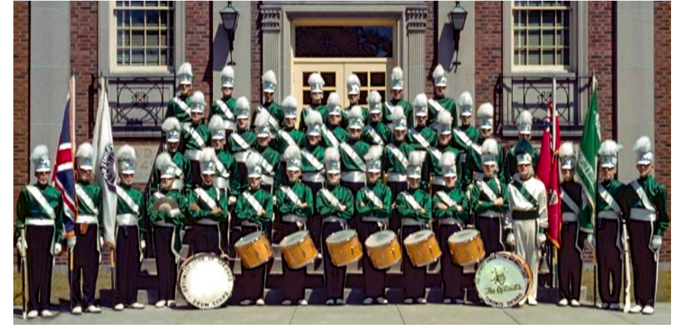
The 1958 Toronto Optimists Drum & Bugle Corps on the front steps of De La Salle "Oaklands". The total corps size was 39 members.

strictly female. All corps, whether male, female or mixed, competed against each other although, for many years, the Canadian Nationals also included an "All Girl" category. Over the years the composition of corps changed so that most of them included both male and female members.