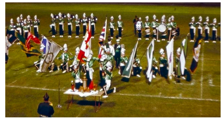
1965 - Toronto Optimists – "Colour Presentation" at the Canadian Nationals in Hamilton, Ontario.

for inspection. During a performance a corps would be penalized a tenth of a point for dropping a piece of equipment plus a full point if it was picked up. Avoiding a one point penalty meant that, if a drum stick, mouthpiece, rifle, etc was dropped we had to wait until a judge (hopefully) picked it up and handed it to us. In addition