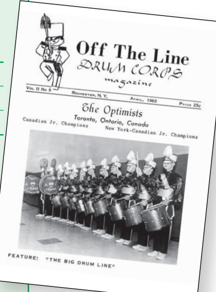
1960 - the cover of "Off The Line" magazine featuring the Toronto Optimists' "Big" drum line that included six snares and three tenors.