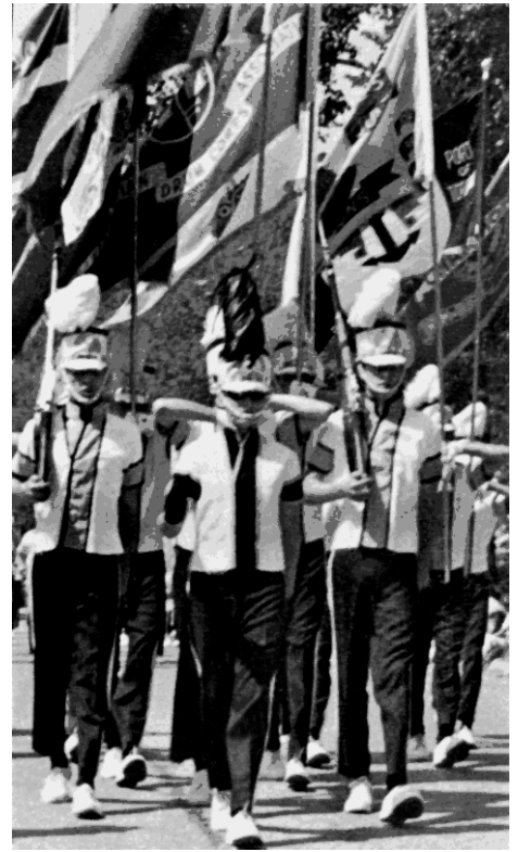
Colour Guard passes in review

Corps for their sons is easily found in the Optimists pro-gram.