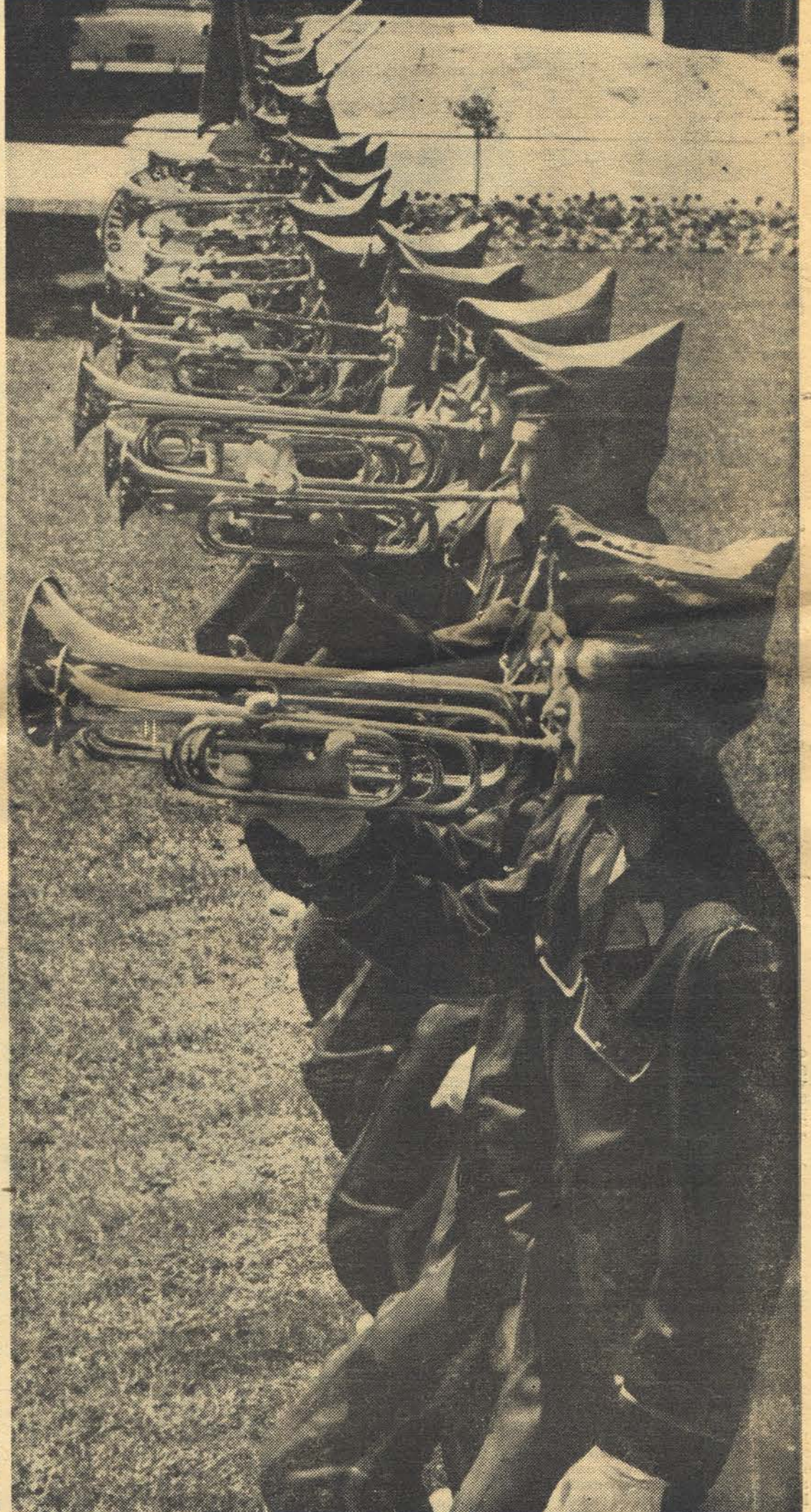
Trumpeters of the Optimist Club of Toronto Trumpet Band lift their instruments high in preparation for the first annual junior championship trumpet band contest to be held next Saturday. Known as the Opti-Corps, the band will sponsor the evening event.

Satur day's championship competition is under the direction of the Canadian Bugle and Trumpet Band Association.