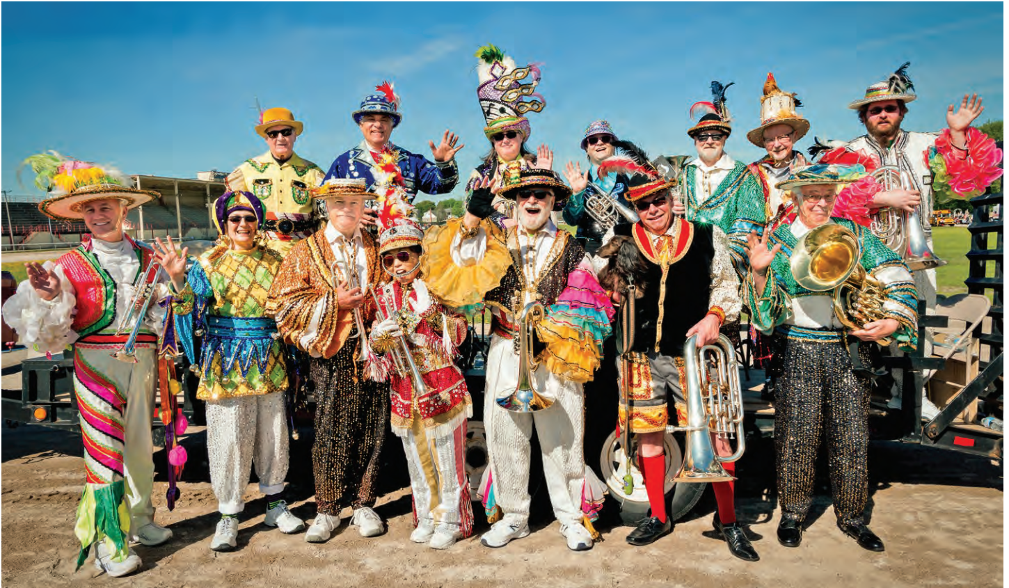
A fun loving group shot just before the mayhem of trying to figure out if there was enough room for everyone on the trailer.

This was our annual trip to Woodstock for the Victoria Day parade. Not only did all of us manage to fit on the trailer but no one fell off! We've been doing this parade since 2008 and everyone looks forward to it. As usual, we had a great time.