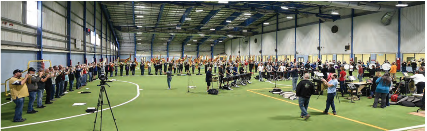
Oktobercorps rehearsing at the Manulife Financial Sportsplex.

In order to include as many people as possible, a decision was made to create 3 groups: a marching contingent, a Percussion Float and a Stage Band Float. Music was selected for each group. The Marching group would play "Ontario" (frequently played by corps in the 60s) and "Old Days" (by Chicago), the Percussion group would play "Minuano" and "Sabre Dance" while the Stage Band would play two Optimists Alumni numbers, "Jump In The Line" and "Everybody Needs Somebody". Arrangements were created