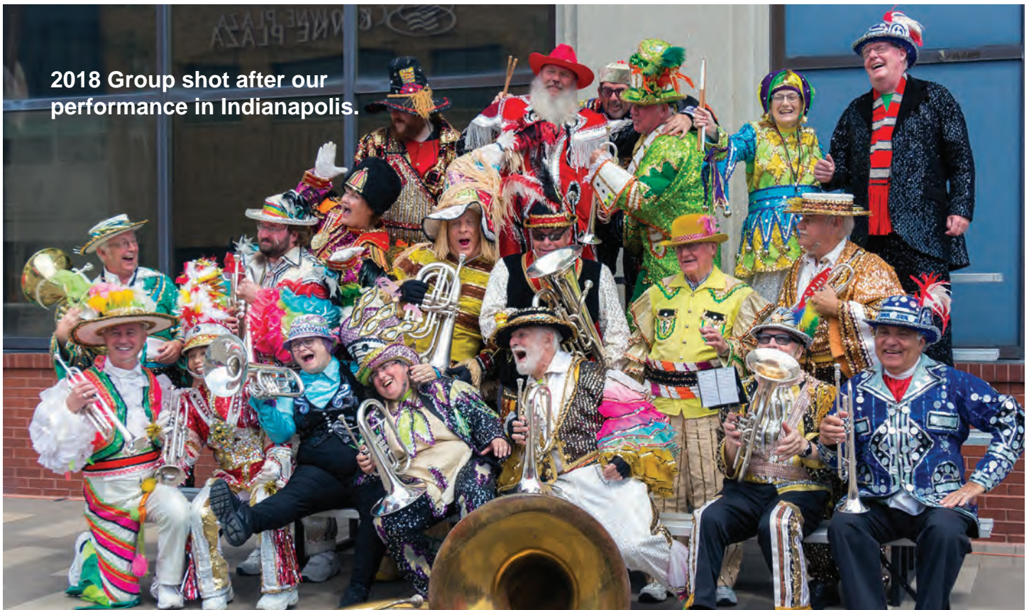
2018 Group shot after our performance in Indianapolis.

The Optimists Alumni Drum & Bugle Corps wish you and your families all the best for the holiday season and the New Year.