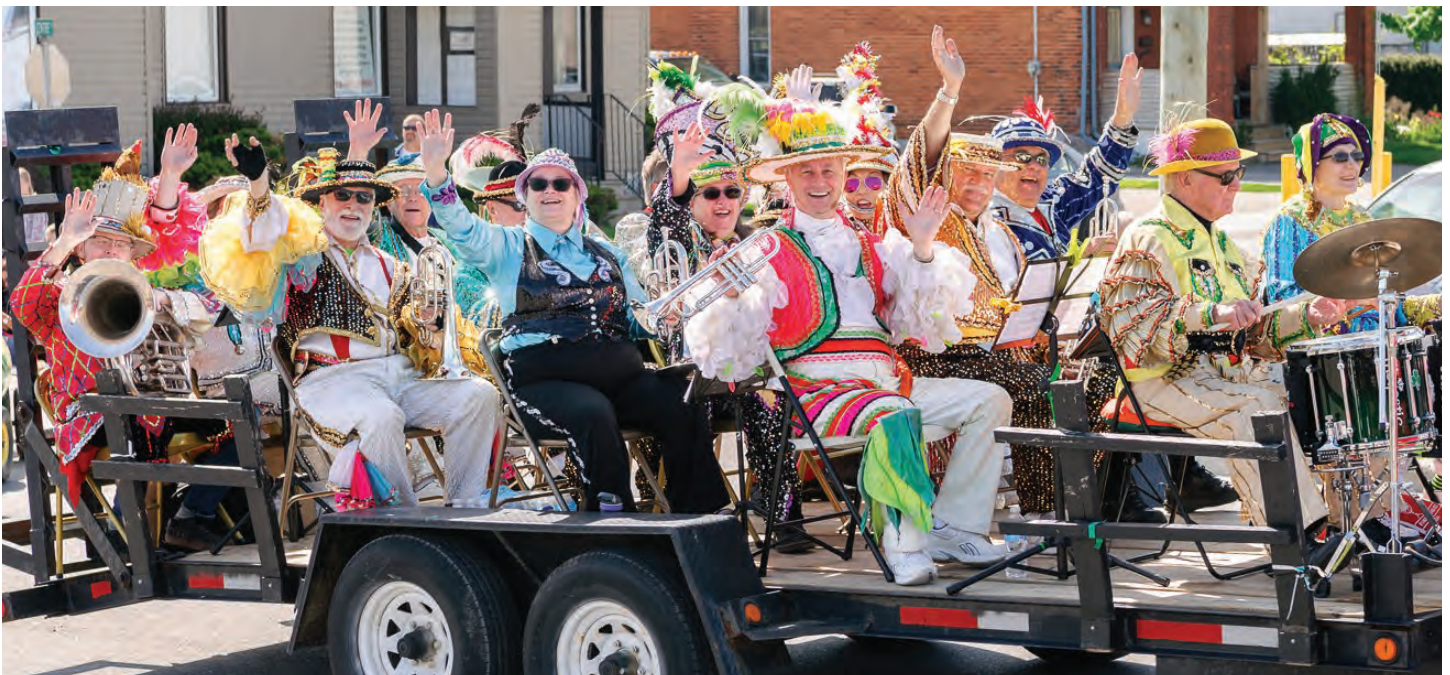
Thankfully everyone got a seat. Look at all of the happy faces!