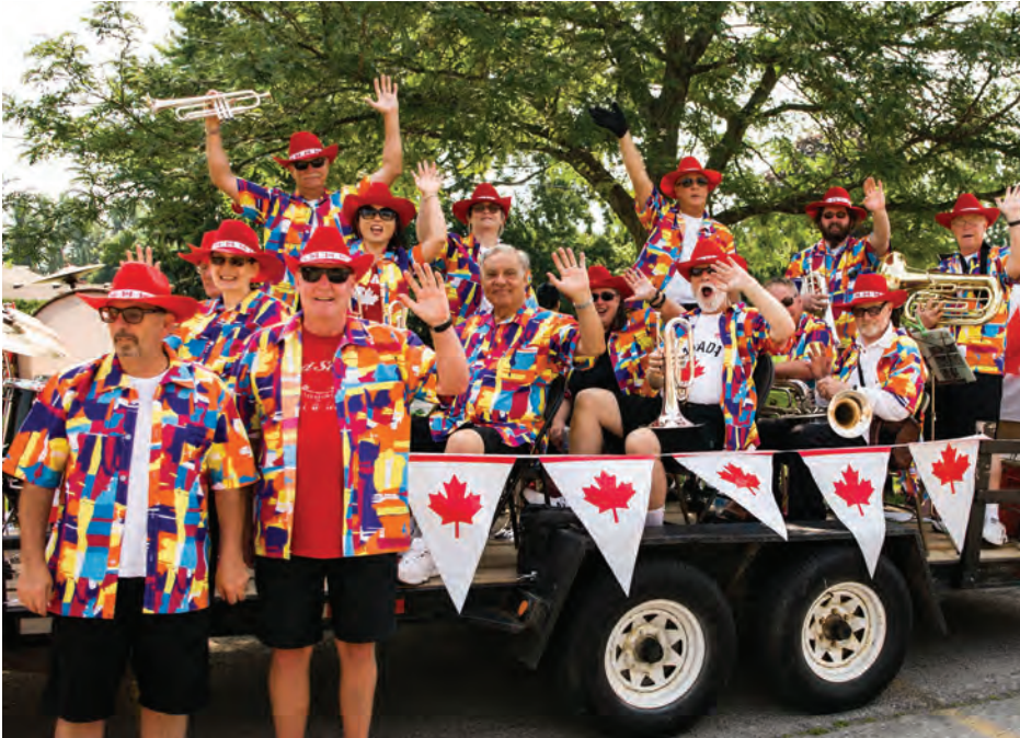
At the start of the parade - staying cool in the shade.

Last year in Caledonia it rained and this year we burned! Still, almost everyone from Caledonia seemed to be on the sidelines, cheering us on and doing their best to get us to play non-stop.