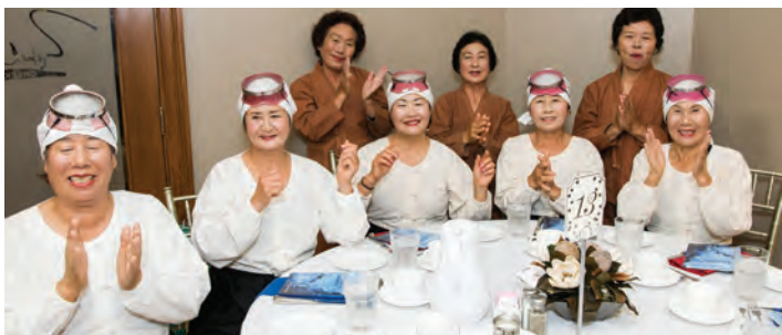
The dancers enjoying lunch

As a finale, everyone joined for a final number. We finished off the afternoon with a delicious meal. A great time was had by everyone.