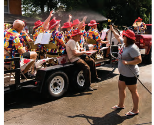
At the end of the parade - getting even cooler.