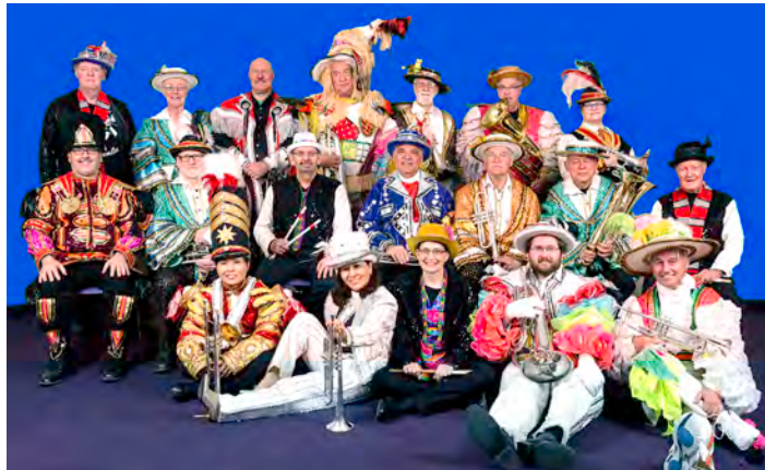
Optimists Alumni in our Mummers' costumes.

Major topics of discussion were things like cost and travel (spending 15+ hours on a plane, each way). Weather was also