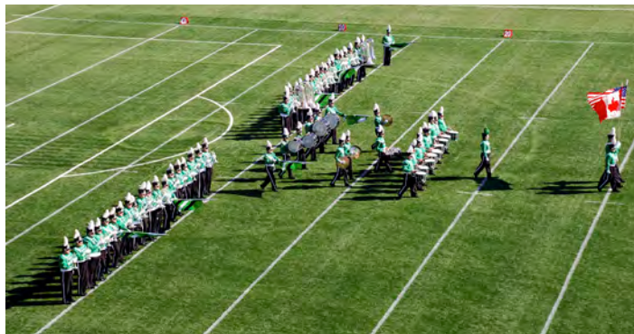
Optimists Alumni, DCA Alumni Spectacular. (2007)

In 2015 we had a performance in May after which we decided to take a break for the summer. In September, at our annual meeting, we addressed the situation. Given our size as well as the physical limitations of some of our members it was clear that we could not continue doing a field show. Having said that, we had a core group of members who still wanted to perform. As a result, there was a reluctance to call it quits. So, what can you do with a dozen horns and 4 drums? Our solution was to reinvent ourselves.