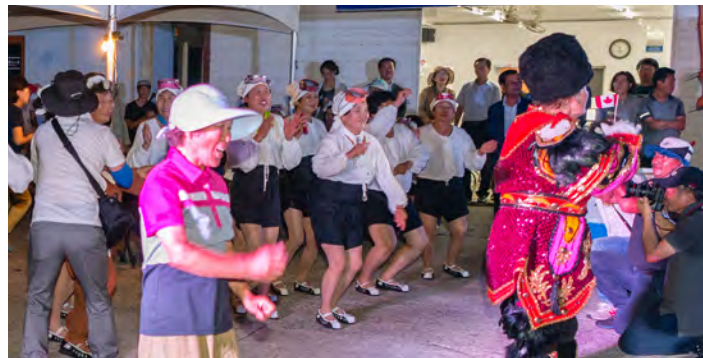
Haenyeo dancing as Optimists play.