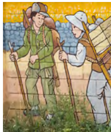
There were many murals throughout Jeju. The city was very clean. Both pedestrian (no j-walking and wait for the light) and drivers (no speeding) obeyed the traffic laws.