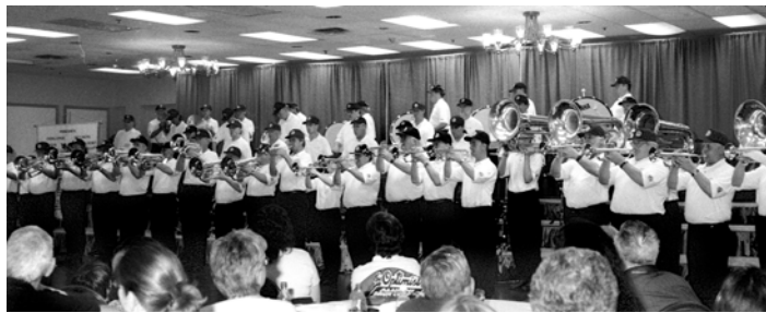
Optimists Alumni G.A.S. (2004)

By 2007, when we performed at our first DCA Alumni show, we owned our own instruments, had purchased green, cadet style uniforms, were doing a full field drill and had added a 10 person color guard; however, we were down to 36 horns and 16 percussion. As happened so often with other Alumni Corps, attrition had set in. Losing members is not a major concern if there is a ready pool of replacements; however, in our case it would have been easier to find the proverbial needle in a haystack. By the time 2014 rolled around we performed at the DCA Alumni Spectacular with only 18 horns, 13 percussion and 4 in the color guard. Like so many other alumni corps, we were disappearing.