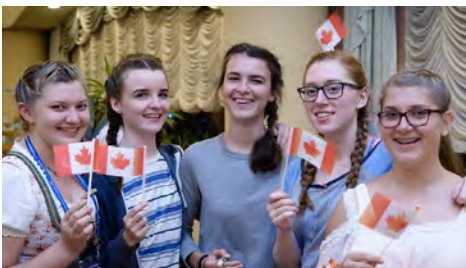
Members of the Bavarian band.