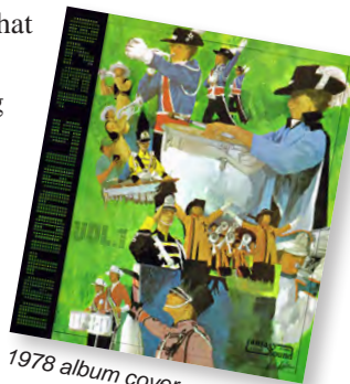
1978 album cover.

DCX Museum is a new website that is dedicated to Drum Corps. It's purpose is "Celebrating, Honoring and Preserving the history of the drum and bugle corps activity around the world. This virtual museum features information on thousands of drum corps from all eras. Scores, repertoire, photos, historical narrative, and a wide range of collectibles from uniforms to bobbleheads."