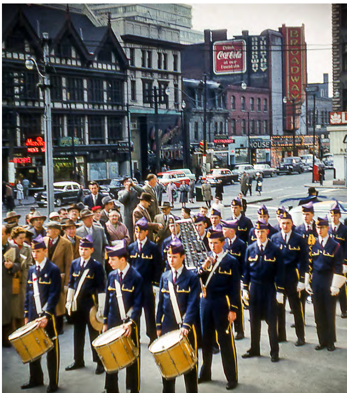
Opticorps in front of Toronto's City Hall, 1956 (now Old City Hall)