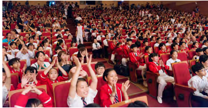
School children enjoying the Optimists Alumni while they waited for the results of their competition.