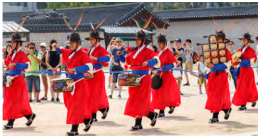
The hourly changing of the guard at the National Palace in Seoul, South Korea. The National Palace Museum is also here.