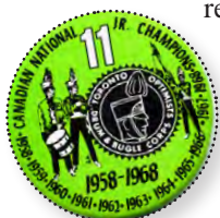
1968 Corps button.

DCX currently includes information on the Toronto Optimists, the Seneca Optimists and the Optimists Alumni. Soon it will include a section on former Optimists