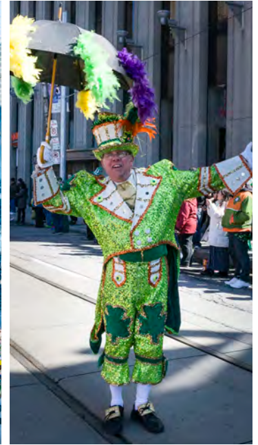
Old City Hall in the background.