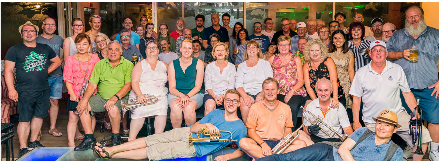
An evening of refreshments and karaoke exchange with the band from Bavaria in a meeting room in our hotel.