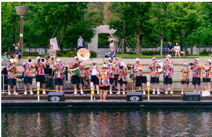
Optimists Alumni at Seongnam City Hall.

On our second day we went to the performance venue, the auditorium at the Seongnam City Hall. We rehearsed two numbers with the massed bands before changing into our parade