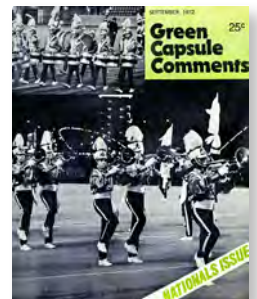
Green Capsule Comments. (1972)