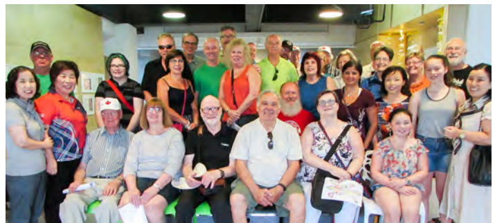
Optimists Alumni at the Minoo Media Art Museum (Seongnam, South Korea).

On our second day in South Korea we visited the Minoo Media Art Museum in Seongnam. None of us were prepared for this experience. Instead of the staid museums to which we have become accustomed, this museum was alive in so many ways. This is really a place that cannot be described; it has to be experienced. Still, I had better try to describe some of it. As an example, there were traditional Korean scrolls as well