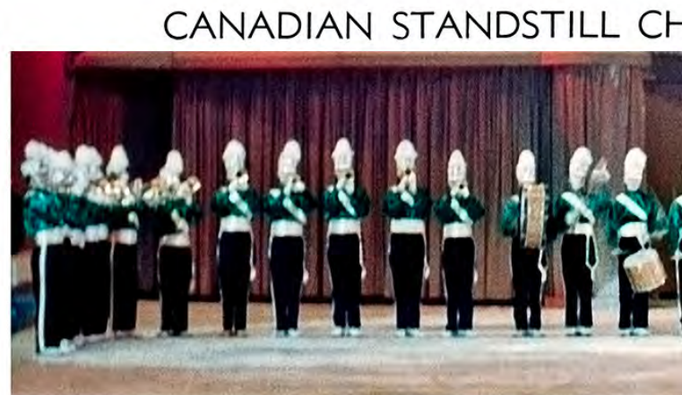
THE OPTIMIST JUNIOR DRUM AND BUGLE CORPS, known as "The Optimists," is sponsored by the Optimist Club of Toronto. They have been in operation for several years as a parade corps and in 1957 took first place in all stand-still contests. This included the Kiwanis Music Festival, the London Music Festival, Waterloo Music Festival and the Canadian championship at Galt, Ontario, Can.

The photo was taken at the 1958 Ice Capades in Toronto.