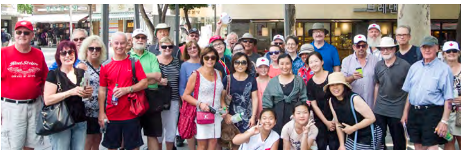
Just off the bus to start a shopping spree in downtown Seoul.

E-Photos should be sent to: Toronto_Optimist@rogers.com