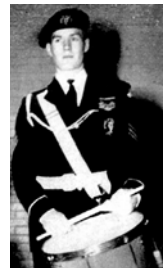
Western Tech. (1955)

He was a champion snare drummer himself while performing with Toronto Jesters senior drum and bugle corps and was instrumental in the amalgamation of the Jesters and Hamilton Viscounts to form the Canadian Commanders drum and bugle corps. He has been teaching the drum line of the world famous Burlington Teen Tour Band since 1977.