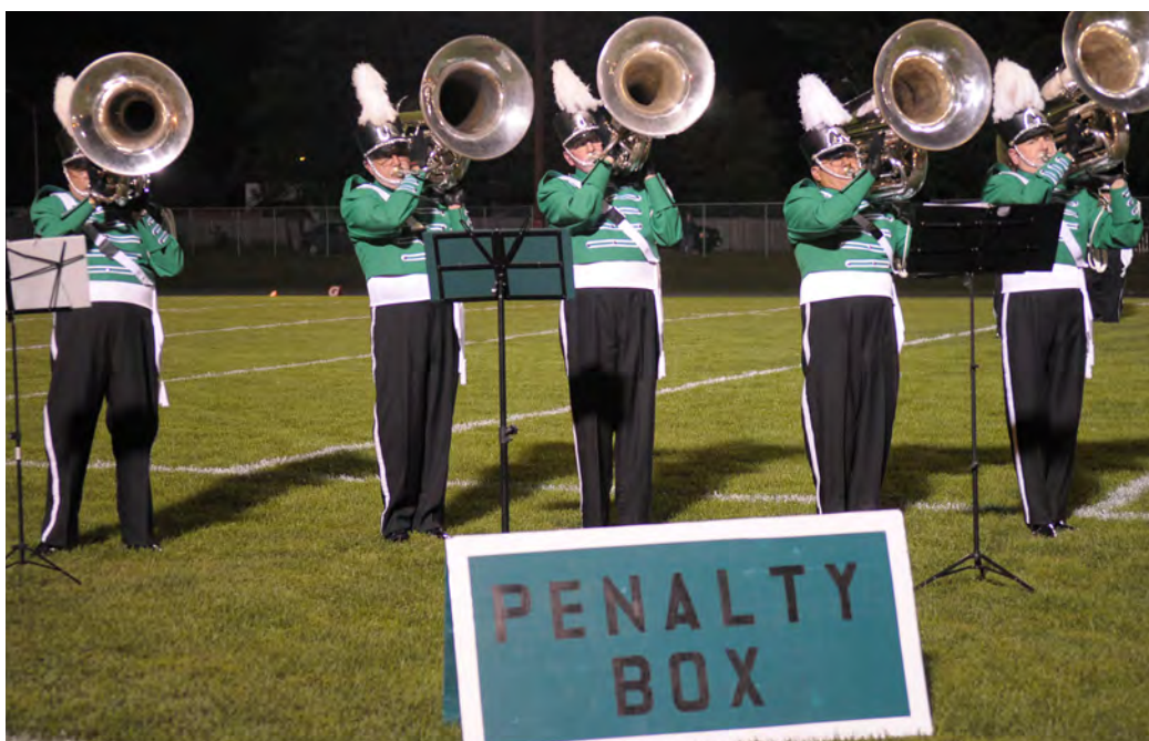
2009. All the contrabass players were relegated to the Penalty Box for not memorizing their music.