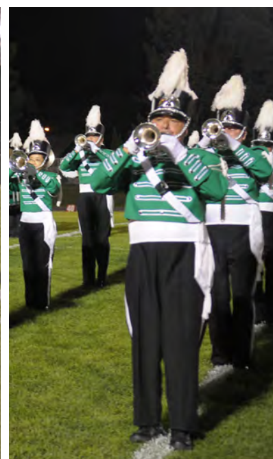
2009. Oshawa at the Legends show.