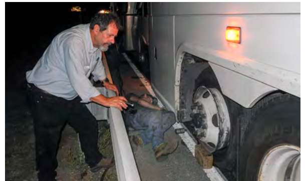
2012. Our bus driver assisting the mechanic change a tire.