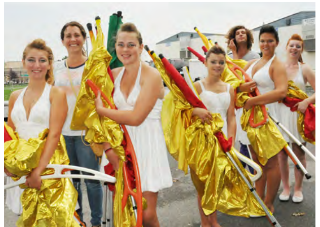
2011. Northstar colours getting last minute instructions before going on the field at the DCA Alumni Spectacular in Rochester.