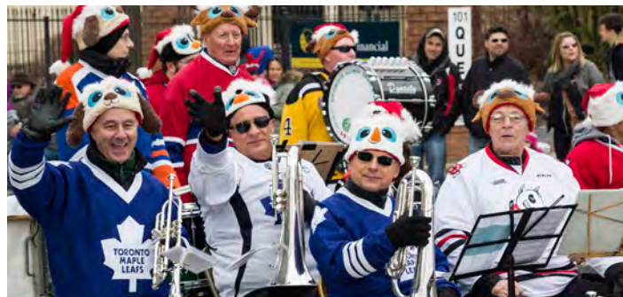
Mississauga Santa parade.