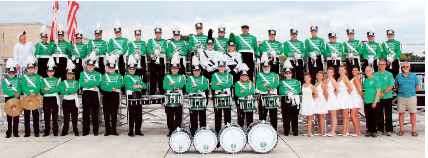
2011. DCA Alumni Spectacular, Rochester, New York.

In 2011 we added a show in Sudbury to our tour. We kept much of our music from 2010; however, we did drop “Patton” from our Colour Presentation and added “Maple Leaf Forever”. We also added “Temptation”, a number that the corps had played back in the late 1960s.