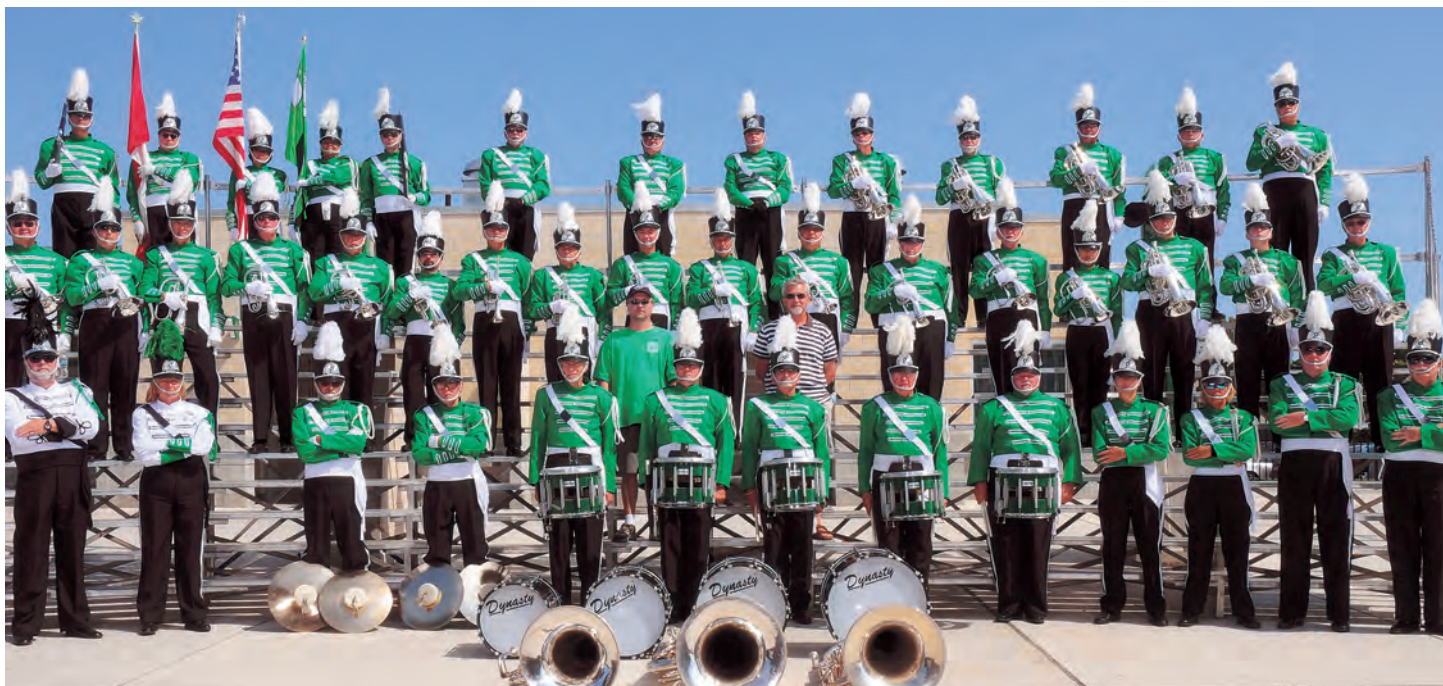
2009. DCA Alumni Spectacular in Rochester, New York.

By 2009 our “tour” was pretty much established. We started the year with St Joe’s show or Simcoe, Victoria Day in Woodstock, our Legends of Drum Corps show, Scout House’s Show and the DCA Alumni Spectacular. Of course there were also the Canada Day parades plus the Santa Claus parades. This year, for the first time, we performed in exhibition at a DCI show in Buffalo. Musically we kept most of the 2008 show; however, we replaced “ Ontario ” with the theme from “ Patton ”.