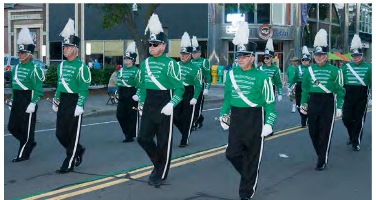
2014 Evening parade day before the big show on Saturday.