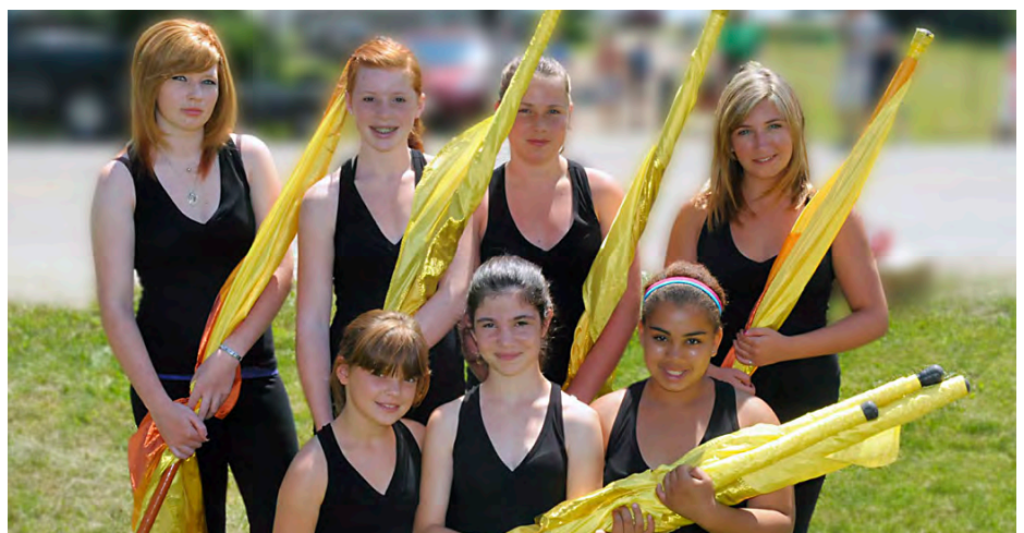
2010. Optimists Colour Guard and the Northstar Colours – DCA Alumni Spectacular in Rochester, NY.