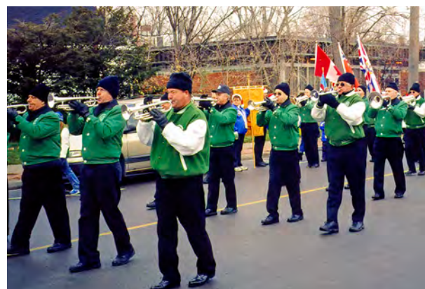
2005 Bowmanville Santa Claus Parade.