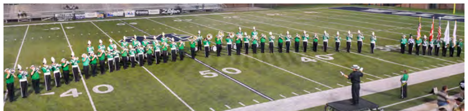
2010. Optimists Alumni and Classic Cavaliers play “ Over the Rainbow ” in Michigan City, Indiana.