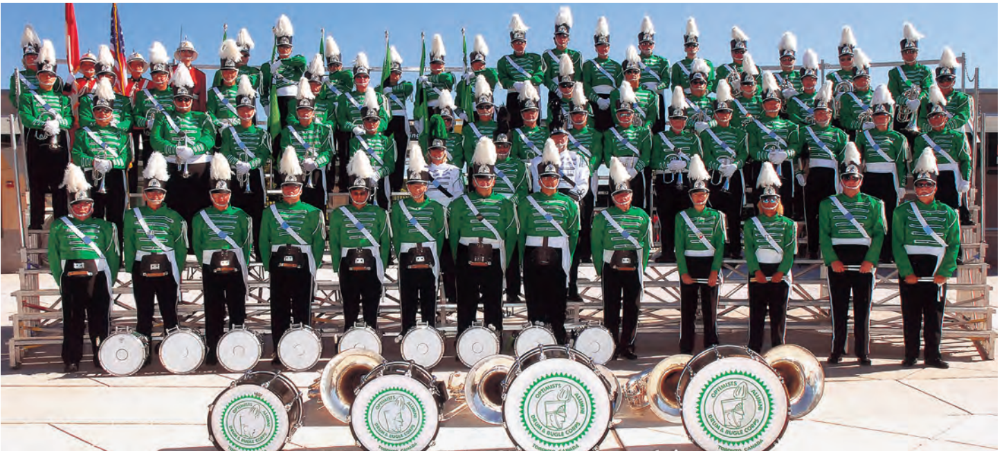
2008. The DCA Alumni Spectacular in Rochester, New York.