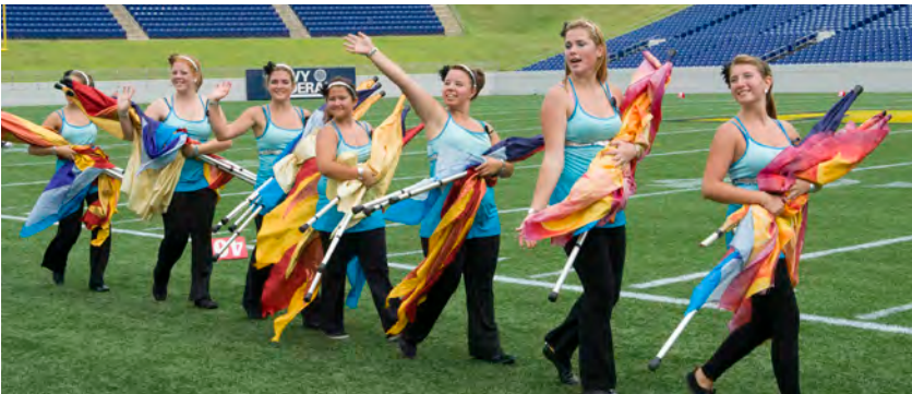
2012. The Northstar Colours.