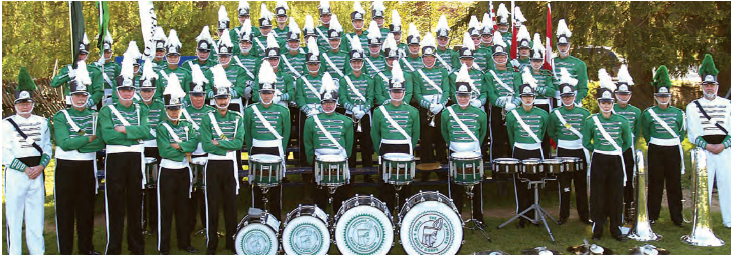
2007. Taken in Simcoe before the first public performance in our new uniforms.

2007 saw a big change in the corps. We got “real” uniforms, started doing a field show plus we went farther afield – to Glen falls, NY and to Rochester, NY for our first DCA Alumni Spectacular. Musically we added another number from 1972, “ More and More ”.