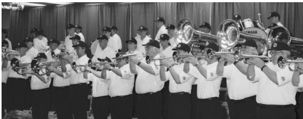
2004 performance at GAS in Hamilton, Ontario.