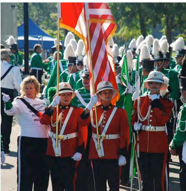
2008. Waiting to perform in Rochester. You can see a couple of members of Toronto Sigs with the National Flags of Canada and the USA.