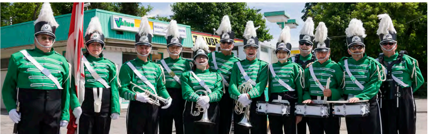
That's a wrap. Let's eat!