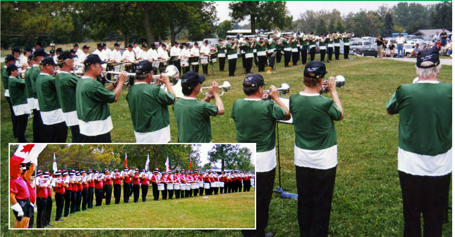
2003. Optimists Alumni's first public performance during the 2003 Corps reunion at the Bruce's Mill Conservation area. Our guests were Scout House Alumni. (inset)