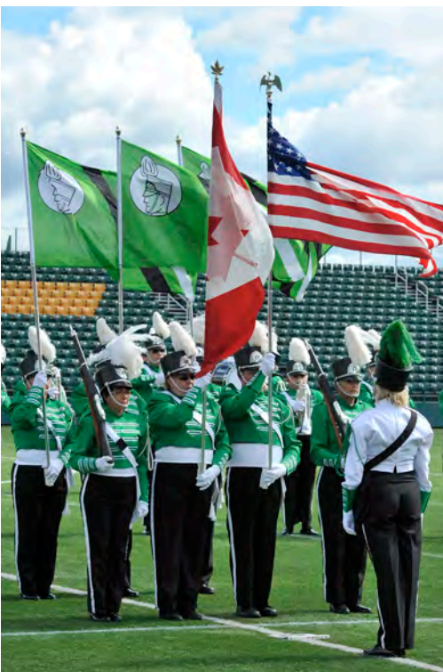
2010. DCA Alumni Spectacular in Rochester, NY.