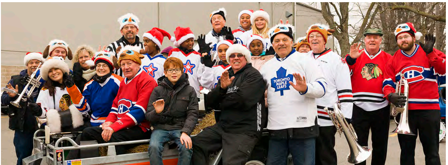
That was fun, wave to the camera. it's a wrap! Let's eat!