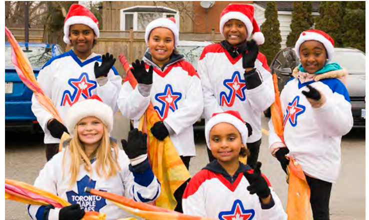
The Northstar Colours always add sparkle to our presentation. They're a treat .