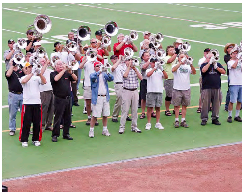
2005. Rehearsing "Caravan" reprise at Scout House show.