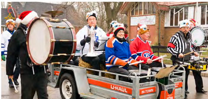
Acton Santa parade.