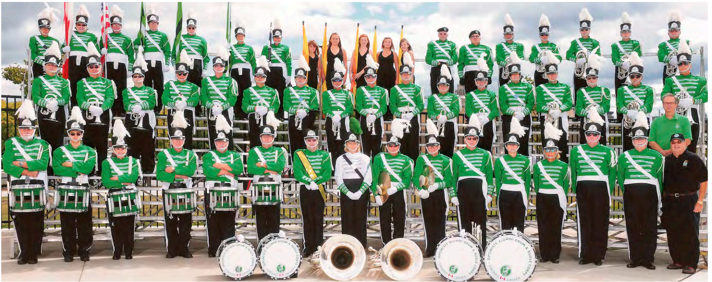
2010. DCA Alumni Spectacular in Rochester, NY.

2010 might have been our busiest year. In addition to our usual events we also performed at City Hall for the participants in a run. Starting this year the Northstar Colours became an integral part of our show. In July we travelled to Michigan City, Indiana, our longest trip to date, to perform in exhibition at a DCI show. At that show we also joined with Classic Cavaliers (Cavaliers Alumni Corps) to play “ Over The Rainbow ”. On the way home we stopped to do a parade in 100°F + weather. Musically we added “ Over The Rainbow ” as our opener while we closed the show with “ What Kind Of Fool Am I ”.