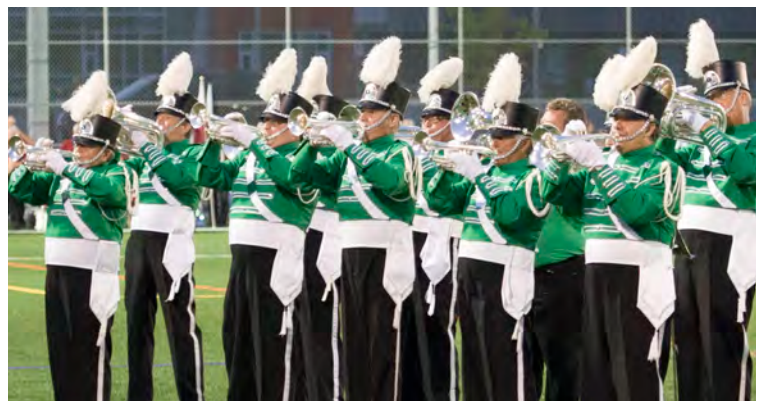
2011. Legends of Drum Corps show, Oshawa, Ontario.