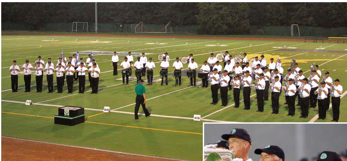
2005. Performing in Waterloo at Scout House's "Juno Beach" show.