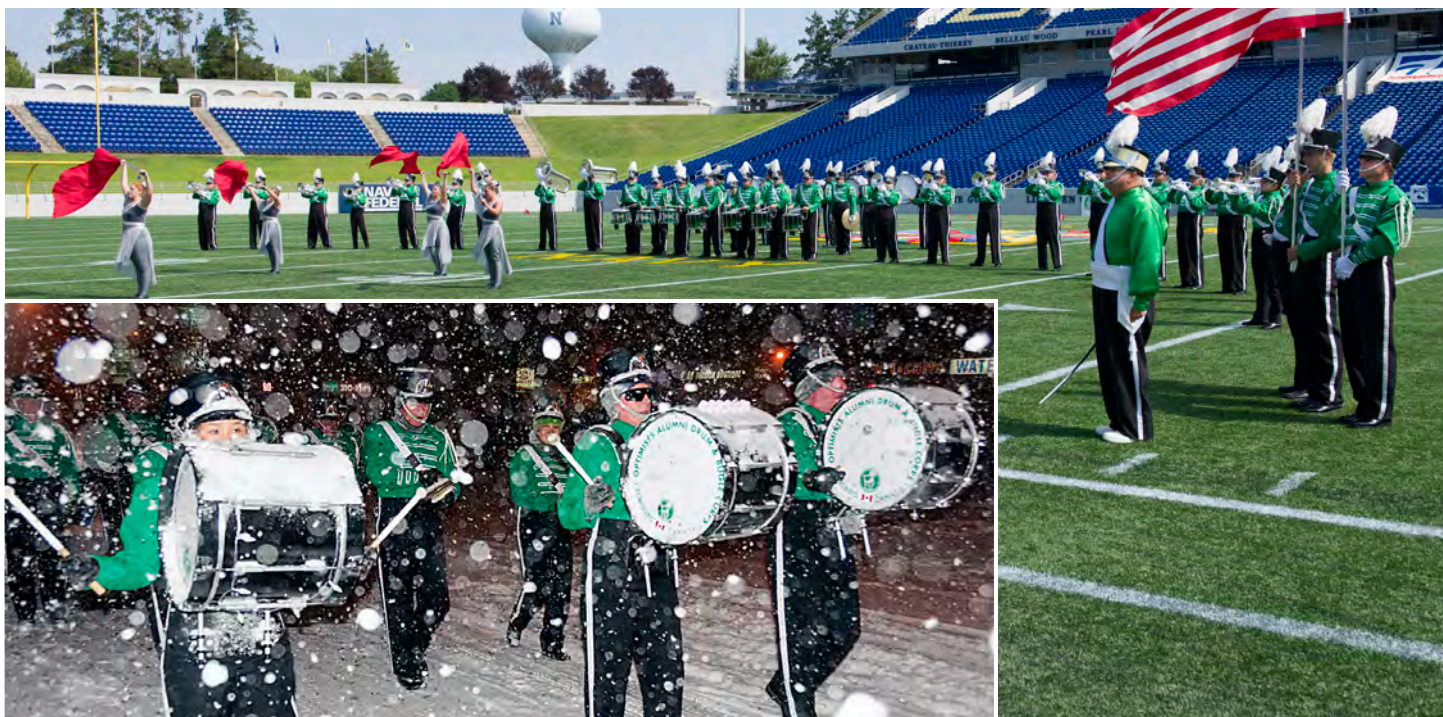
2013. Annapolis, Maryland. Inset: The Great Snow Parade in Aurora.