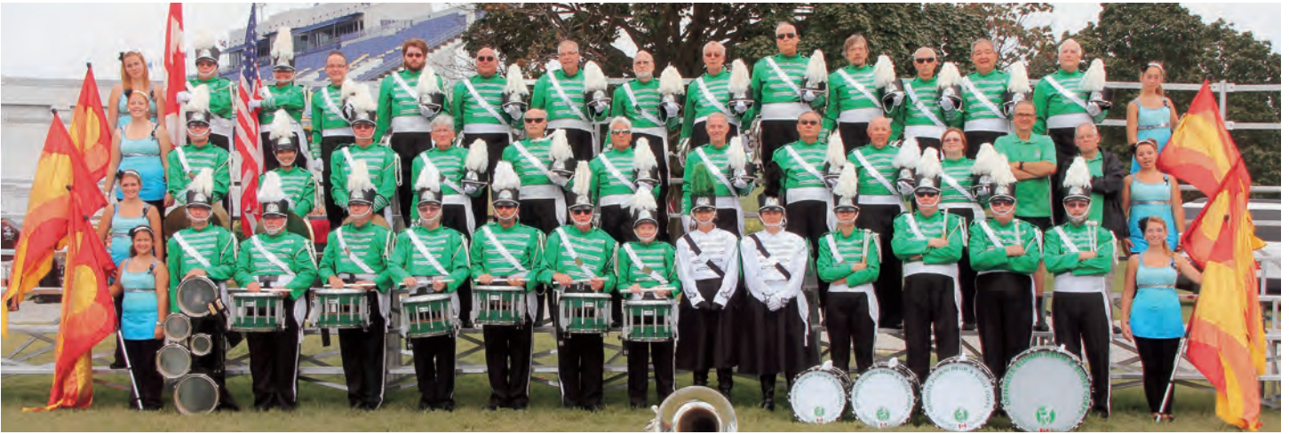
2012. DCA Alumni Spectacular, Annapolis, Maryland.

In 2012 the DCA Alumni Spectacular was moved to Annapolis, MD. Getting there, however, was quite the venture. When we reached the border we were put in the wrong line for US Immigration and lost a couple of hours. Later, the bus had a blowout somewhere in Pennsylvania. We left Toronto around 8 am and arrived, very hungry and tired, at our hotel around 3 am the next day. After rehearsing all day Saturday in the heat and humidity I doubt that any of us will be complaining about Toronto's weather. Musically we opened our show with Optimists' 1975 Judy Garland Medley. We kept our concert and colour presentation and closed our show with "Beautiful People".