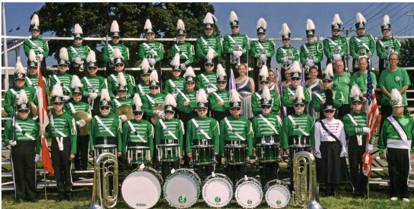
2013. Annapolis, Maryland.

2013 was much the same as 2012. Musically we kept the same opener, added a new arrangement of “Caravan” for concert, played a rewritten “Maple Leaf Forever” as a Colour Presentation and closed the show with “I Have a Love” and “Somewhere” from West Side Story.