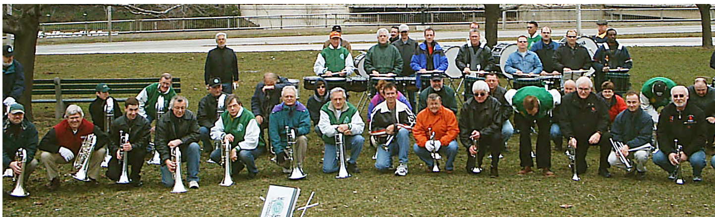
2004. "Oh man it was cold".