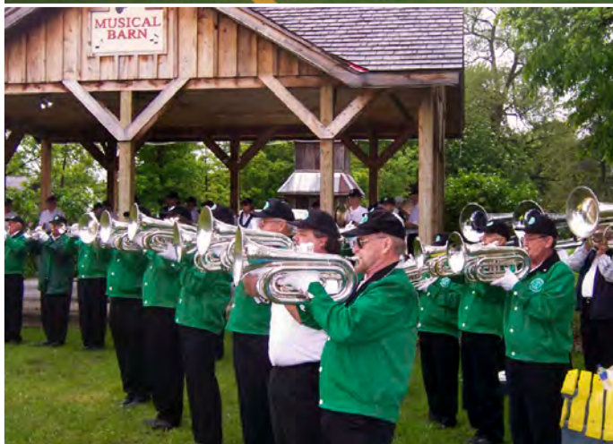
2006. Waterloo. Inset: Coldwater.