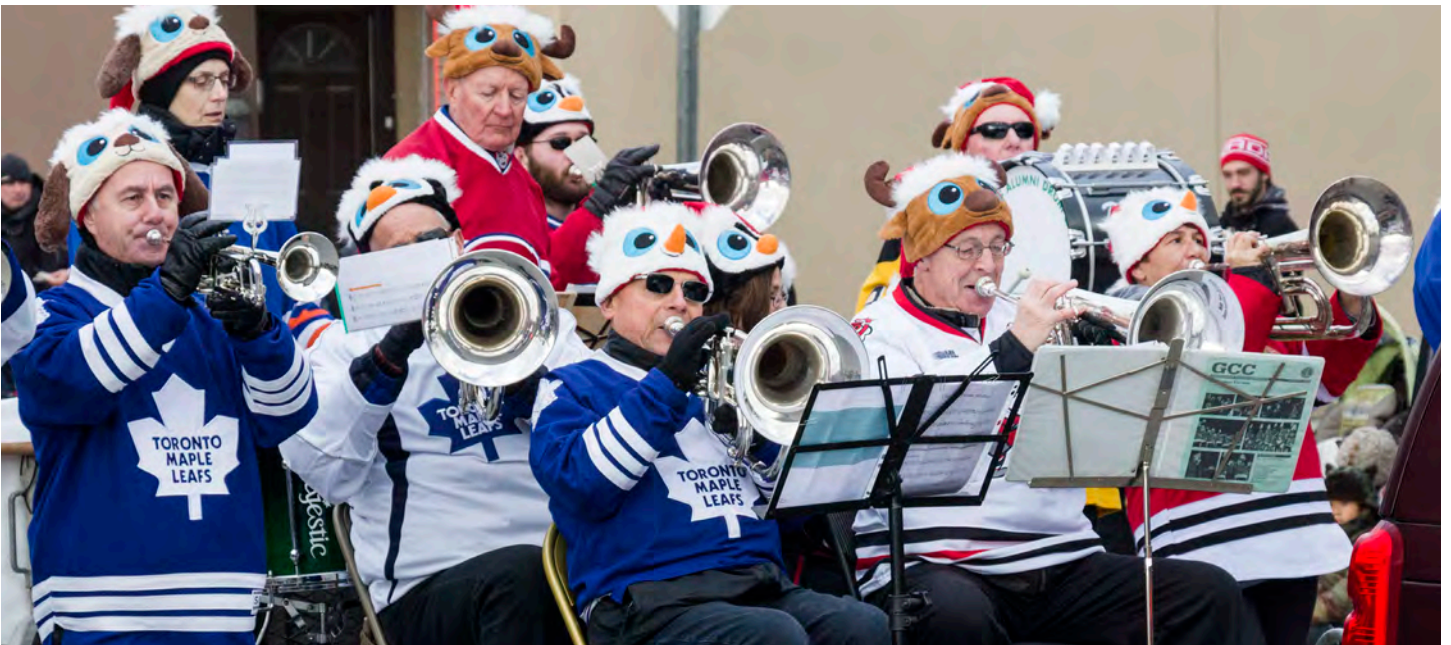
That's a wrap. Let's eat!