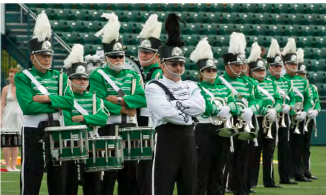
2011. DCA Alumni Spectacular, Rochester, New York.