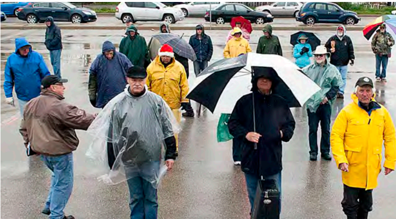
2011. Just another fun filled Sunday afternoon rehearsal. Everyone can't wait till break, so they can relax and put their feet up, enjoy a refreshing beverage and soak up the sunshine.