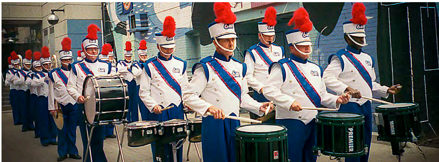
2004. Performing in Lotto 649 television commercial.