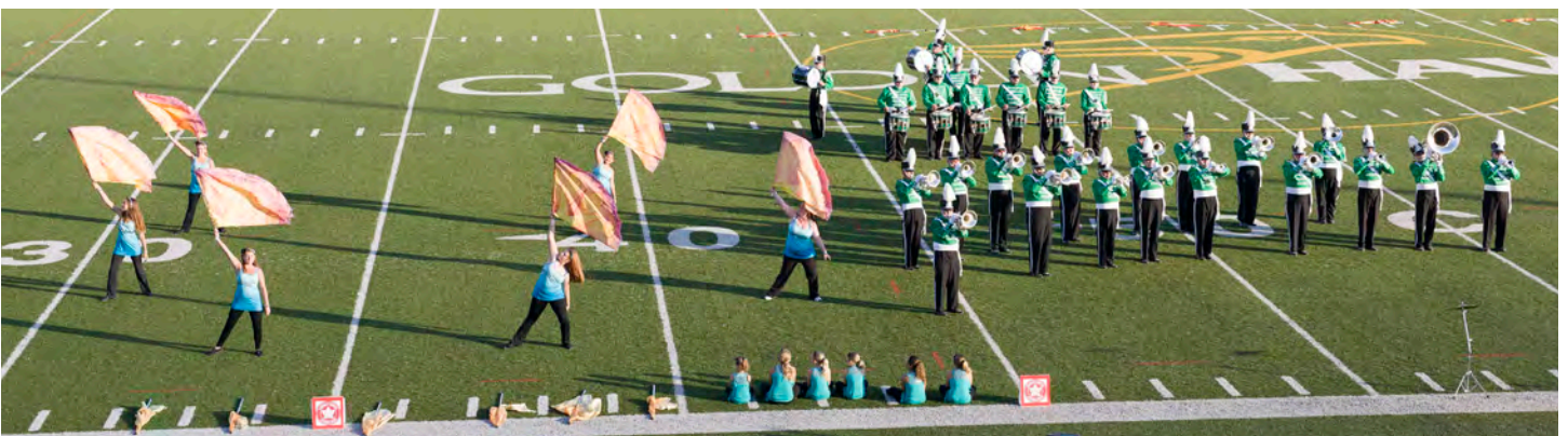
2012. The Scout House Alumni Band show in Kitchener. The group sitting on the sideline are junior members of The Nortstar Colours.