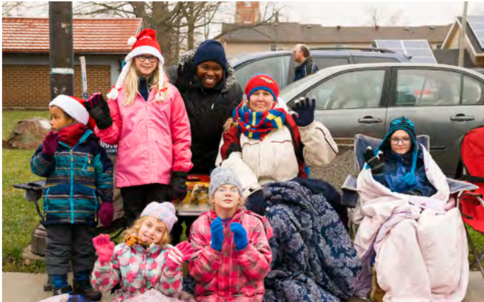
Waiting for Santa.

The light rain stopped and the Santa Claus Parade started. There were community groups and service organizations, colourful bands and performers, public and high school bands, riders on horses – all marching and singing through the middle of town