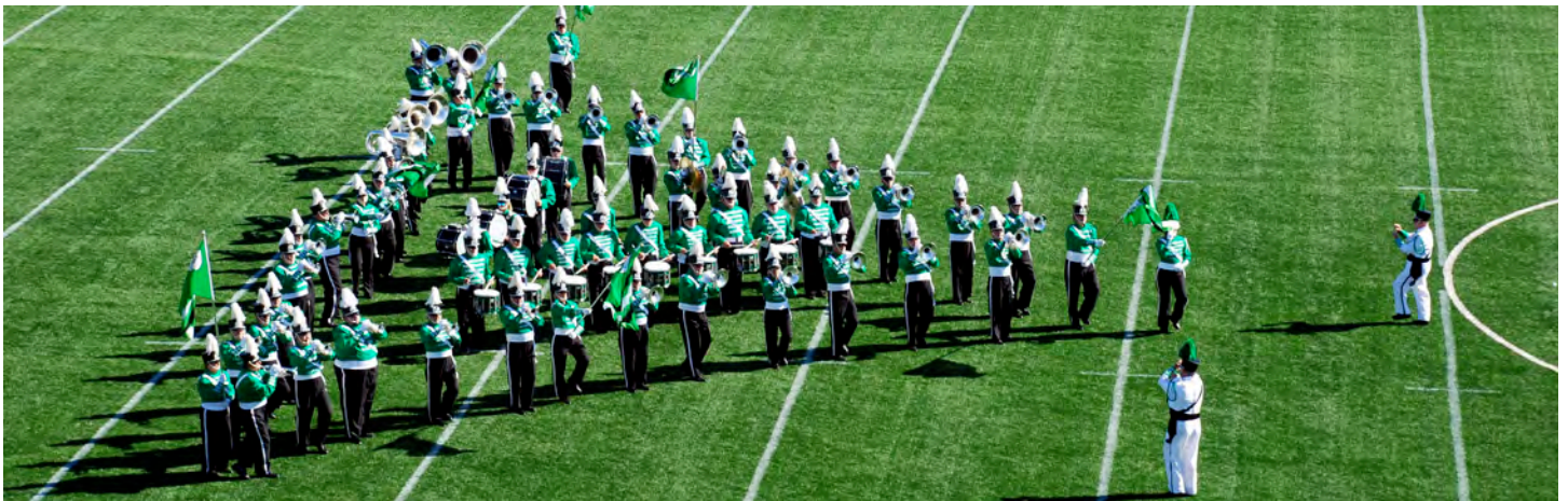
2007. Above: Shows part of the drill for “Paint Your Wagon” at the DCA Alumni Spectacular in Rochester, NY. Below: Formal corps photo – Rochester.