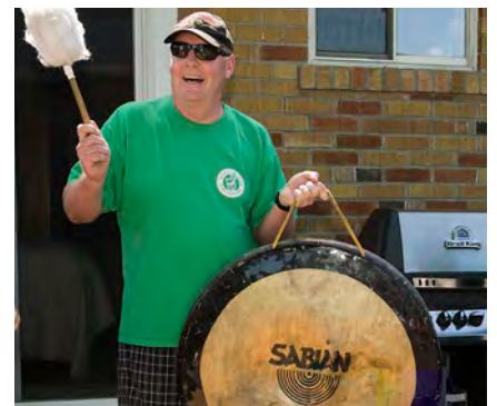
“OK, OK. Listen up. At the sound of the gong, it's time to go home”.