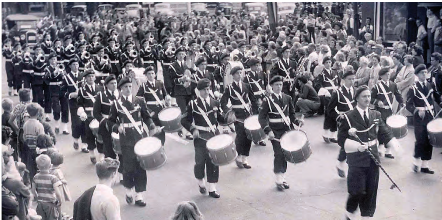
Western Technical School Trumpet Band. 1955