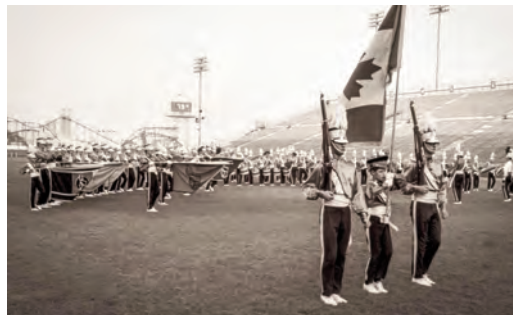
Canadian National Exhibition. 1970

a copy. Perhaps you have a copy in a treasure chest or an old banker's box that contains memories of your youth. Have you looked in it lately? If you looked you might find old photos or film of the Corps. Maybe it contains newspaper clippings about the corps or a journal or a scrapbook or even a corps uniform? One of our members even found an old corps flag. Who knows what