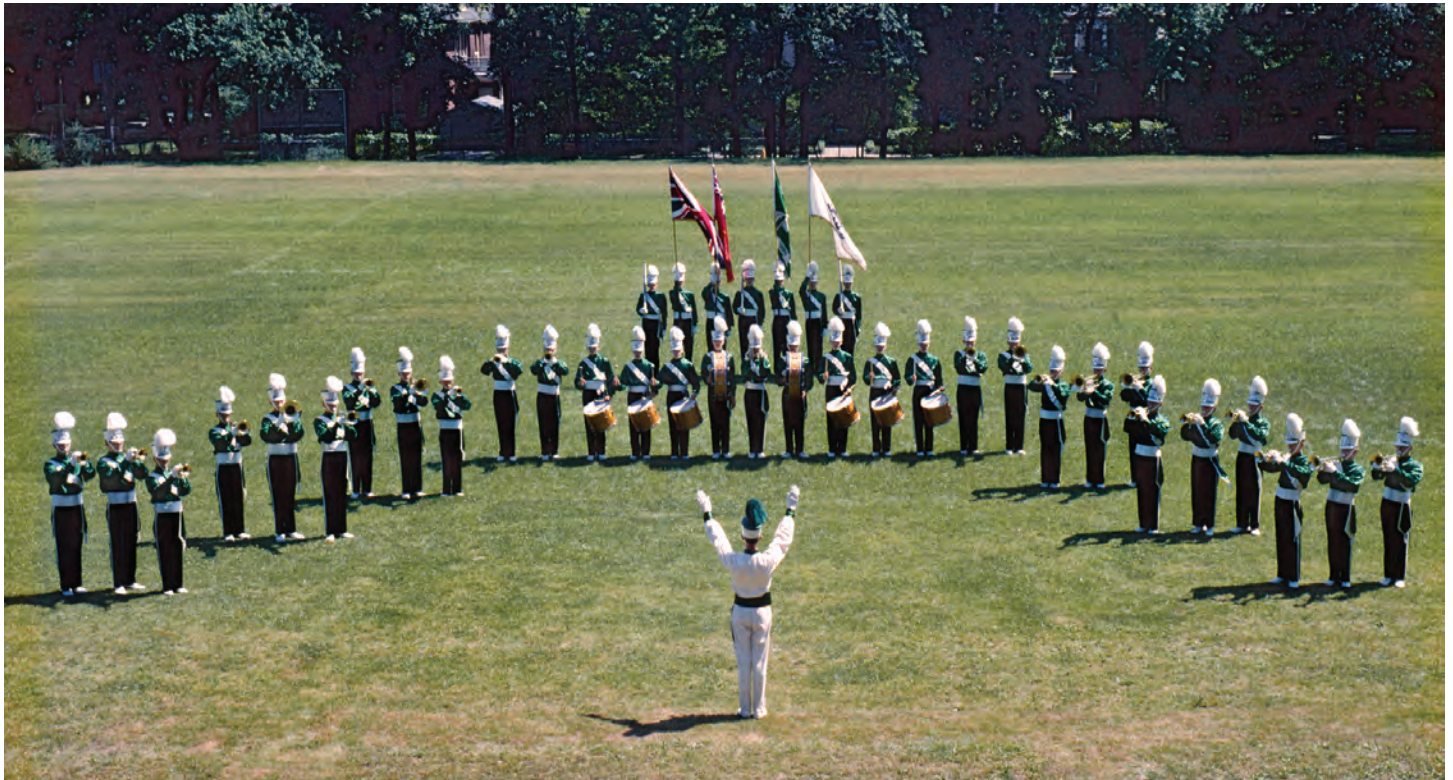
This photo of Optimists was taken in 1958 on the playing field at De La Salle. At this point both corps were "newbies" since 1958 was the year that both Optimists and De La Salle moved into Junior "A" competition. Soon they became fierce competitors with each pushing the other to higher levels of performance.