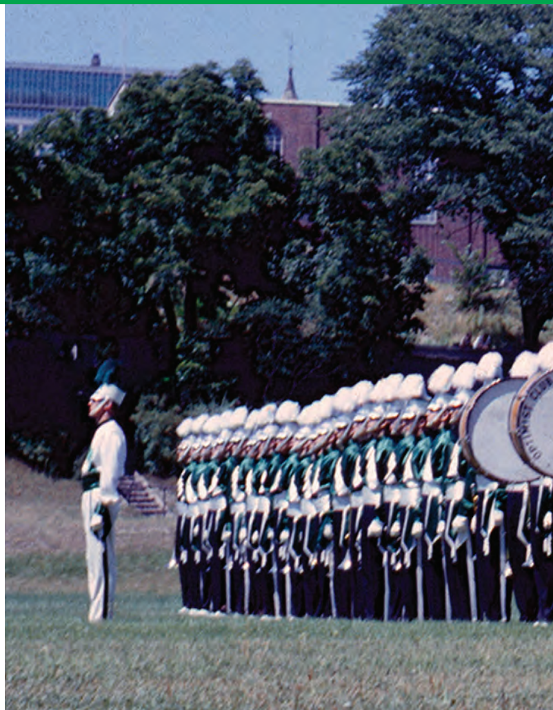
The 1958 Toronto Optimists Drum & Bugle Corps, Canadian Junior A Champions,