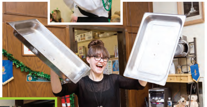
The traditional "Clanging Of The Tray Lids" signaling "Dinner Is Served".