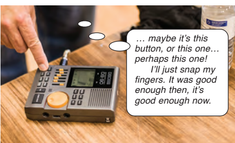
The metronome is an essential part of any rehearsal, especially for the “over 39” members.