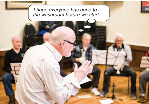
Allways looking on the bright side.