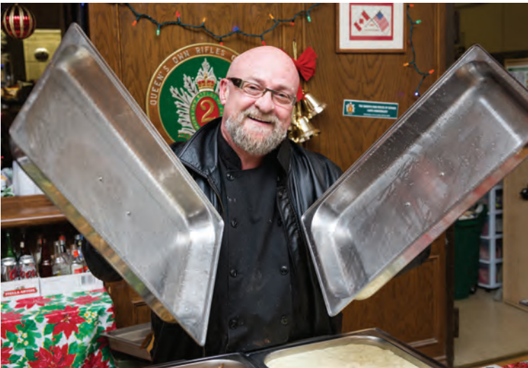
With the traditional "Clanging Of The Tray Lids"... dinner is served. Yes we we did suggest that he consider joining the cymbal line.