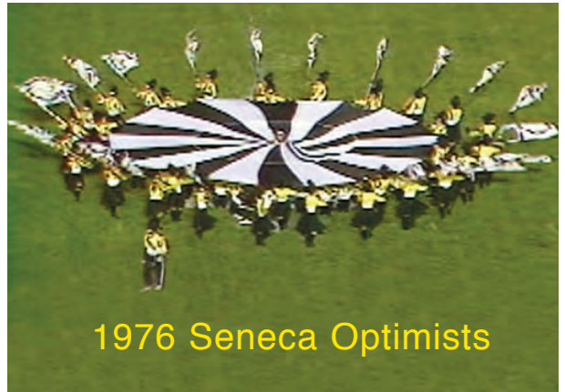
1976 Seneca Optimists

His creative show design skills, as well as his adjudication abilities have been well recognized. He earned the honor of becoming a member of the D.C.I. Hall of Fame, Class of 1999.