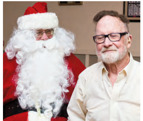
"Gee thanks Santa. You have such discriminating taste"