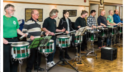
The drumline continues .....