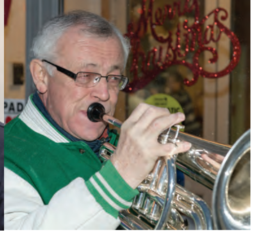
Warming up just outside the front door... so far, so good. However the sour pickle tongue didn't work as well as he'd hoped.