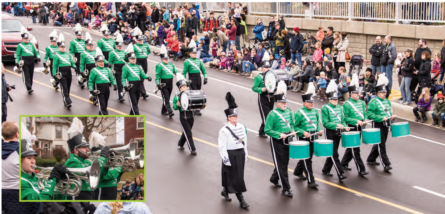
Thanks to the mild temperatures in Guelph the corps actually enjoyed playing their holiday parade repertoire.