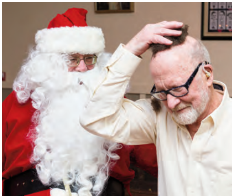
"It's a fuzzy brush? No, wait... is it hair?"