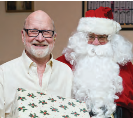
"For me? Such a big gift Santa."