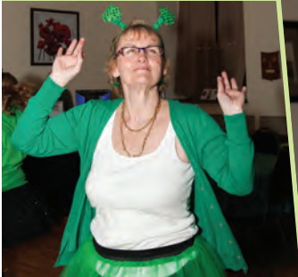
"More champagne, why thank you."