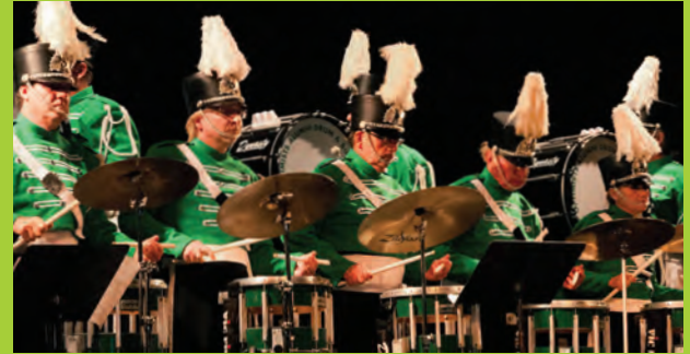
Optimists Alumni performing in 2012 at the "And The Bands Played On - 8". The show is hosted by the Simcoe United Alumni Drum and Bugle Corps.