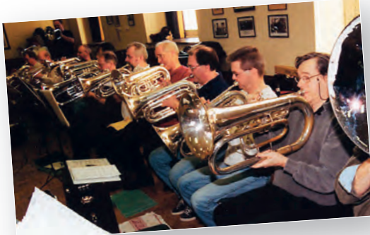
2003 rehearsal at the Legion.

As the season progressed we learned some of the tunes that the corps played in the early 60's; for people that had not played in 40 plus years, a relatively aggressive undertaking. However, we persevered and were able to pull it off by the first performance, in Optimist Style, even though I was very concerned and nervous. Looking back we did quite well and should be proud of ourselves. ◻