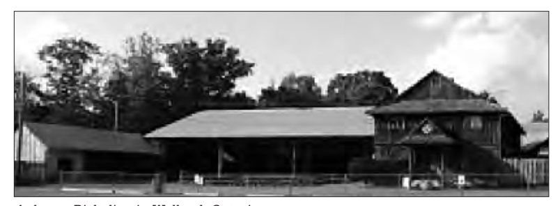
Auberge Richelieu in Welland, Ontario

The corps brought their road show to Welland as part of an ongoing mission to revitalize drum corps activity in southern Ontario.