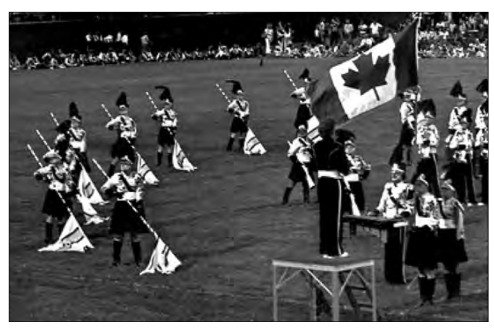
Seneca Optimist 1976 - Pageant of Drums - Michigan City, IN