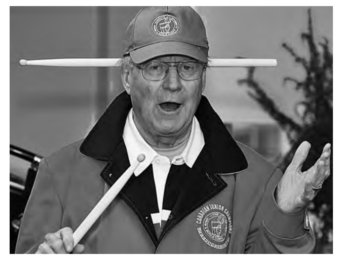
Has anybody seen my other drumstick?