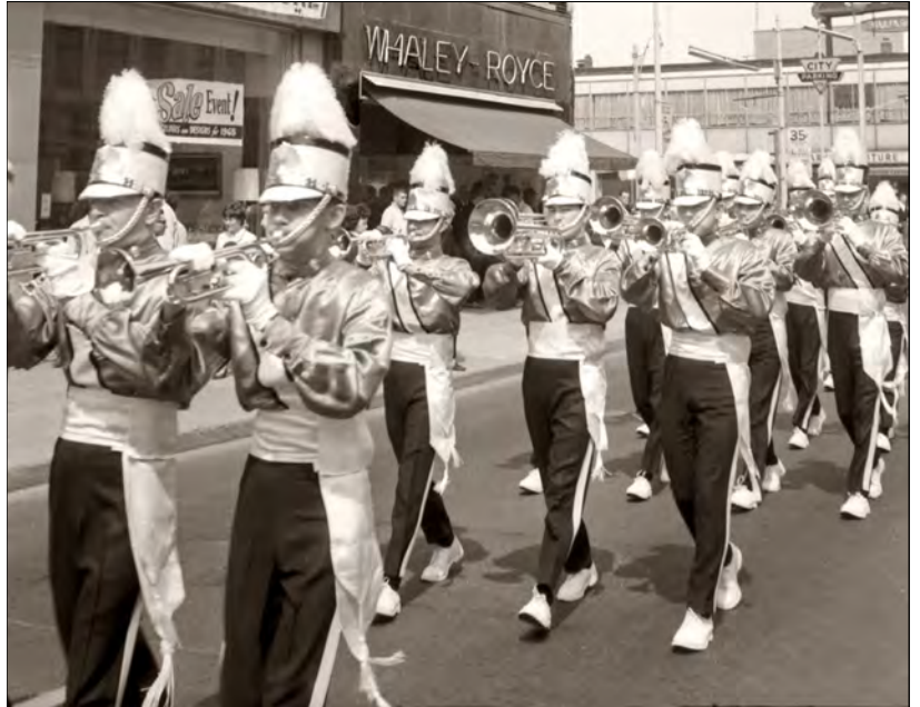
Toronto Optimists on Yonge Street in front of Whaley-Royce (1965)

During the 1960s Whaley-Royce was a bit of a home away from home for many of us who marched in drum corps, especially those in Toronto-based drum corps. If we wanted to buy drum corps records we'd go to Whaley-Royce. If we wanted the latest contest scores or drum corps magazines we would, again, go to Whaley-Royce. Looking to connect with members of one's own or other corps? That's right, we'd meet at Whaley-Royce!