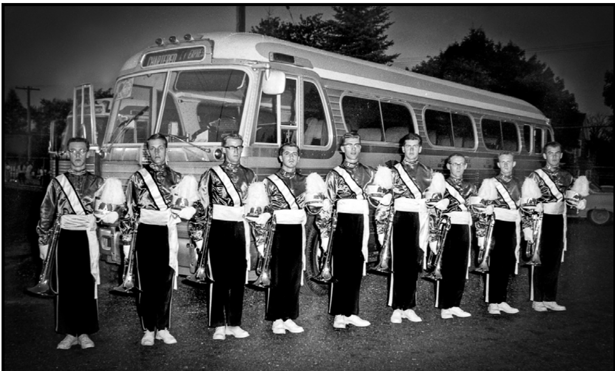
The Baritones, with their new horns (Left to Right)