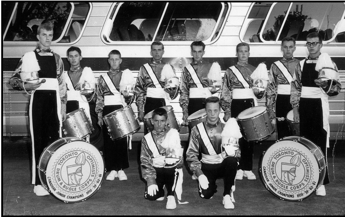
The Drumline (Left to Right)

The first time the corps wore their new uniforms — and just before beating Blessed Sacrament. Here are a couple of photos taken just before the show