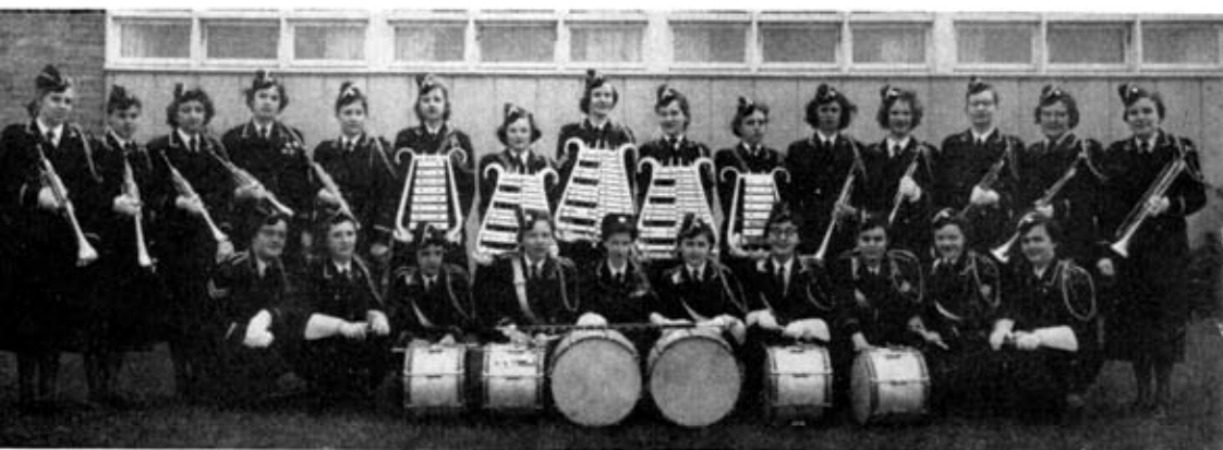
Host Band to "Music on the March"